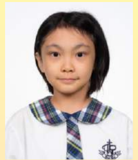
Prudence (6 Kindness 22 )