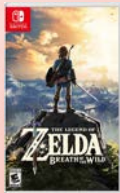
The Legend of Zelda: Breath of the Wild