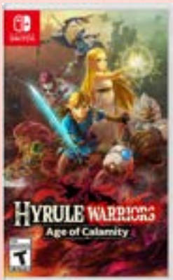
Hyrule Warriors: Age of Calamity

I think both of these games deserve 5 stars. I love these games! I will recommend them to my teachers and friends.