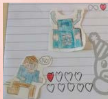
Kaye's drawing of Warden