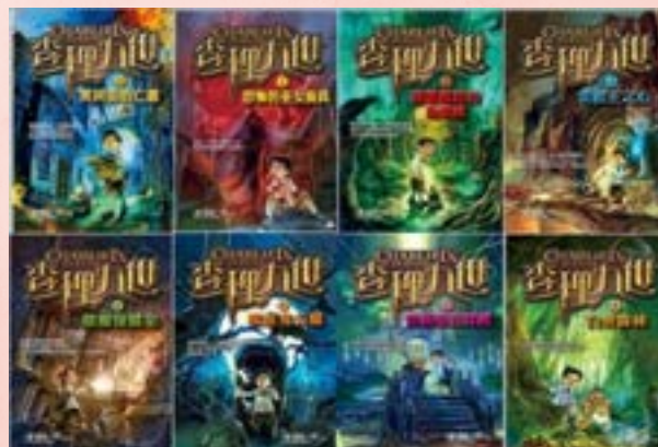
Charlie IX series of books