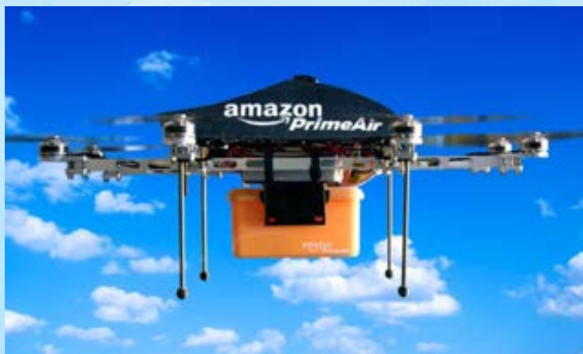
Amazon Prime Air drone

Right now, Amazon Prime Air is only for the USA. It is not yet available in Hong Kong. I think it is great because deliveries will be so fast. I hope it will be in Hong Kong some day!