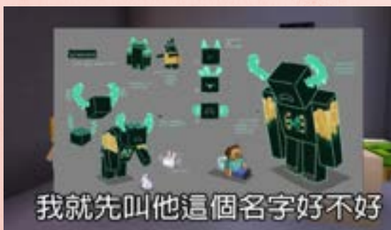
Warden in Minecraft

I think he is the strongest character in Minecraft. Because he is the strongest creature in the whole world, I hope you can avoid him if you are playing Minecraft!